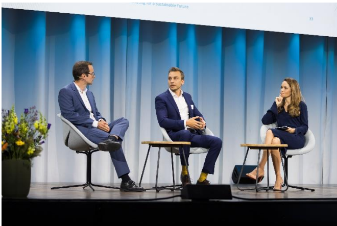
SSF Annual Conference 18 June 2026 - 2