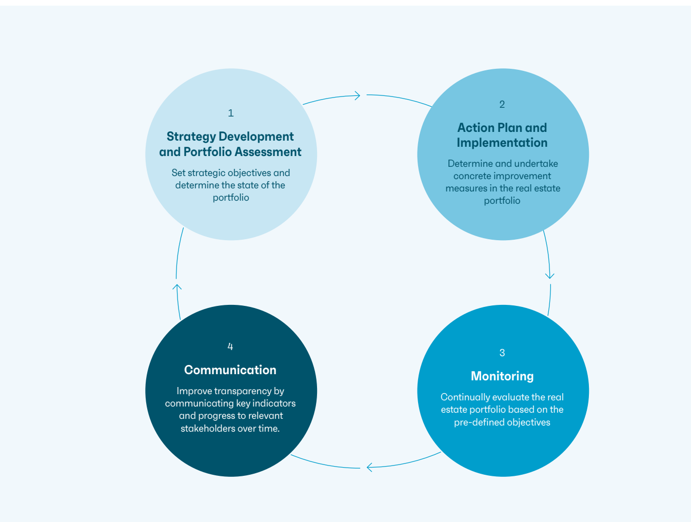
Figure 2: Four-stage Approach for Integrating Sustainability Factors into Real Estate Investments

Assess the current state of the real estate portfolio regarding its ESG aspects