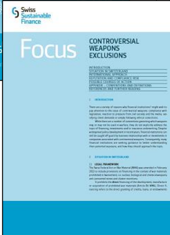
Focus: Controversial Weapons Exclusions