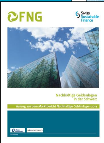
Swiss Market Study on Sustainable Investments (2016 & 2017)