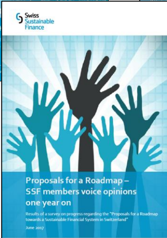
Survey Results: Proposals for a Roadmap – one year on